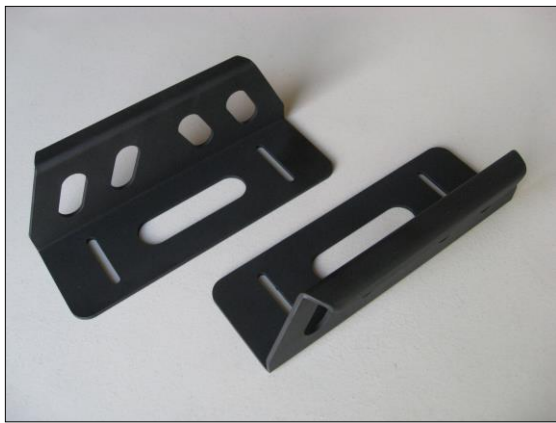
SIDE RAIL BRACKET KIT SRB-100

Introducing the new Cross Rail and Side Rail Bracket Kits for the PRO SERIES Modular Cargo Rack Systems.