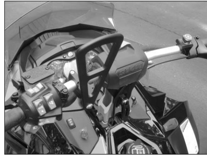
SWINGARM ROTATED TO "UP" POSITION