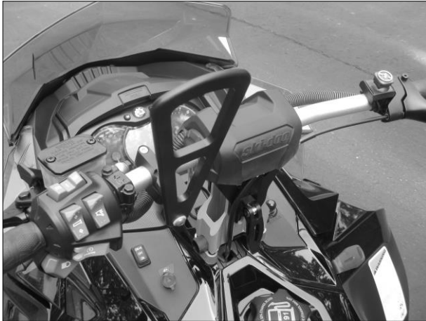
HELMET HANG'R™ INSTALLED ON SKI-DOO® MXZ™

Introducing the new HELMET HANG'R™ from Up North Technologies. A safe, convenient, handlebar-mounted storage device for your helmet.