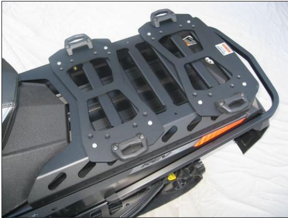
UNIVERSAL LINQ™ ADAPTER BRACKETS (2) SHOWN INSTALLED ON PRO SERIES MODEL SD-137-XS

Introducing the new Universal LINQ™ Adapter Bracket Kit for the PRO SERIES Modular Cargo Rack System.