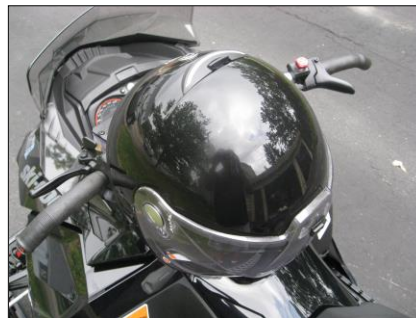
HELMET PLACED ONTO SWINGARM