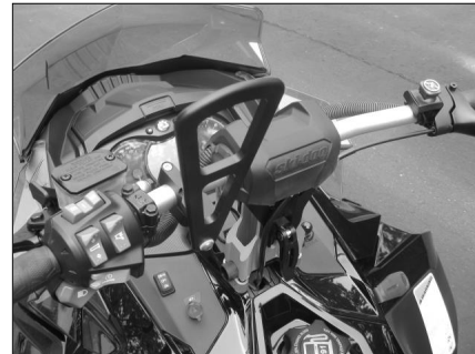
SWINGARM ROTATED TO "UP" POSITION