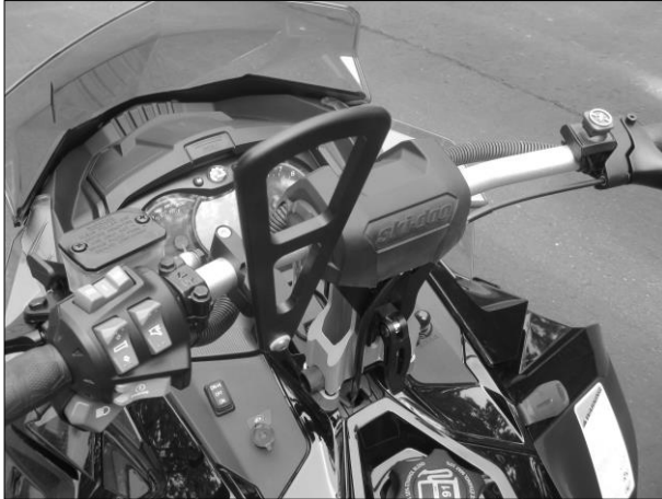
HELMET HANG'R™ INSTALLED ON SKI-DOO® MXZ™

Introducing the new HELMET HANG'R™ from Up North Technologies. A safe, convenient, handlebar-mounted storage device for your helmet.