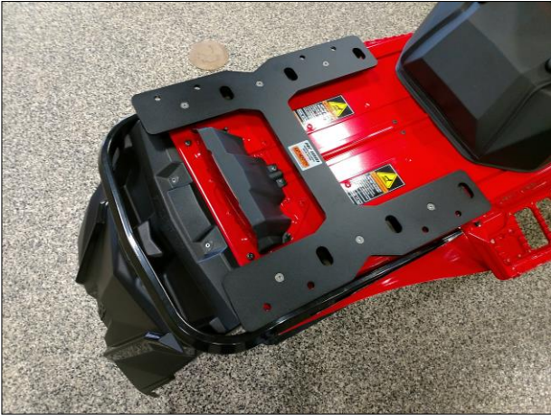
LMP-2-XC DUAL-POSITION LINQ™ ADAPTER BRACKET SHOWN INSTALLED ON POLARIS® INDY XC™ 129