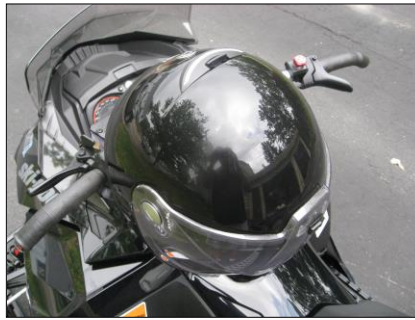
HELMET PLACED ONTO SWINGARM