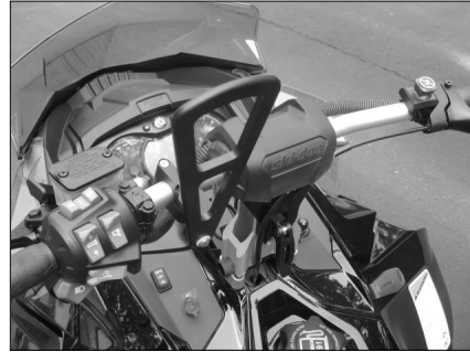
SWINGARM ROTATED TO "UP" POSITION