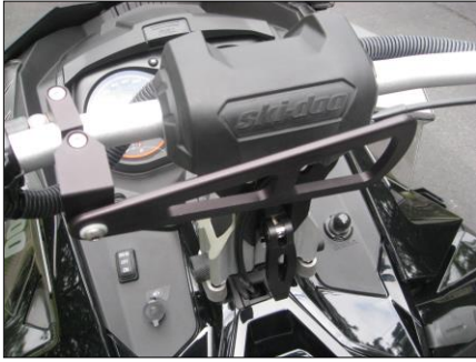
SWINGARM IN "DOWN" POSITION