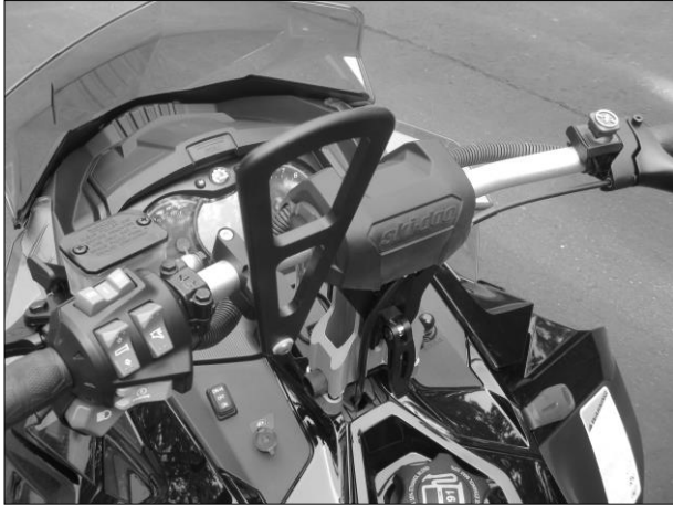
HELMET HANG'R™ INSTALLED ON SKI-DOO® MXZ™

Introducing the new HELMET HANG'R™ from Up North Technologies. A safe, convenient, handlebar-mounted storage device for your helmet.