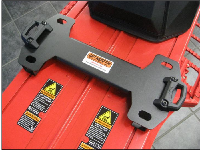
LMP-1-T SHOWN INSTALLED ON POLARIS® SWITCHBACK™