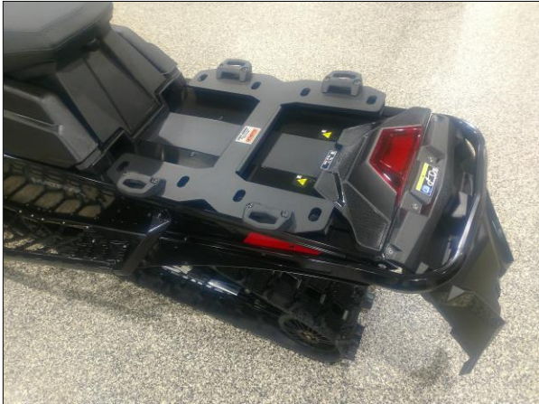
LMP-2-T DUAL-POSITION LINQ™ ADAPTER BRACKET SHOWN INSTALLED ON POLARIS® MATRYX™ 137